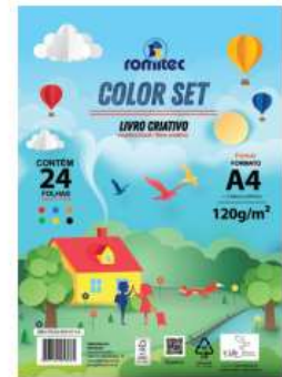
COLOR SET A3 E A4 ISBN