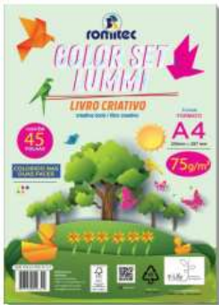
LUMMI 75Gg/m 2 ISBN