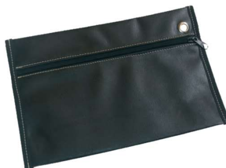
PVC BAG ELECTRONICALLY WELDED