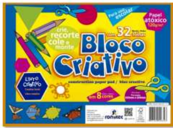
BLOCO CRIATIVO A3 E A4 ISBN