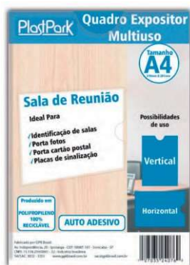
PP MULTIPURPOSE DISPLAY FRAME