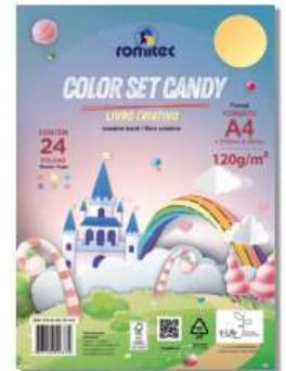
COLOR SET CANDY ISBN