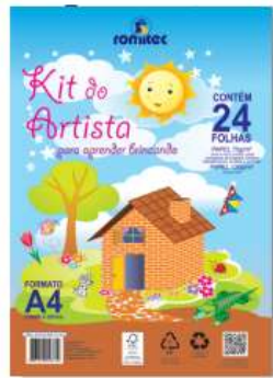
KIT DO ARTISTA ISBN