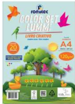
LUMMI 120g/m 2 ISBN