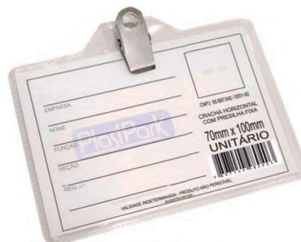
BADGES AND DOCUMENT PROTECTORS